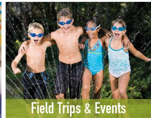
Field Trips & Events