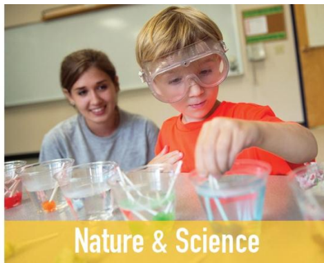
Nature & Science