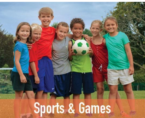
Sports & Games