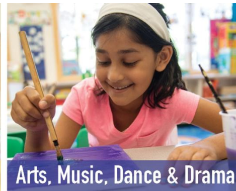
Arts, Music, Dance & Drama